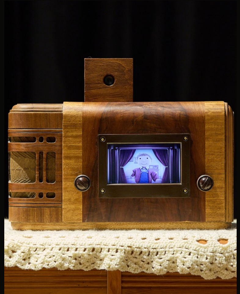
THE VICTORY BOX | CUSTOM-BUILT ELECTRONIC SCULPTURE | 2025-26