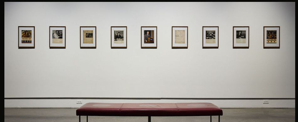
THE SYNTHETIC ARCHIVE | INSTALLATION VIEW