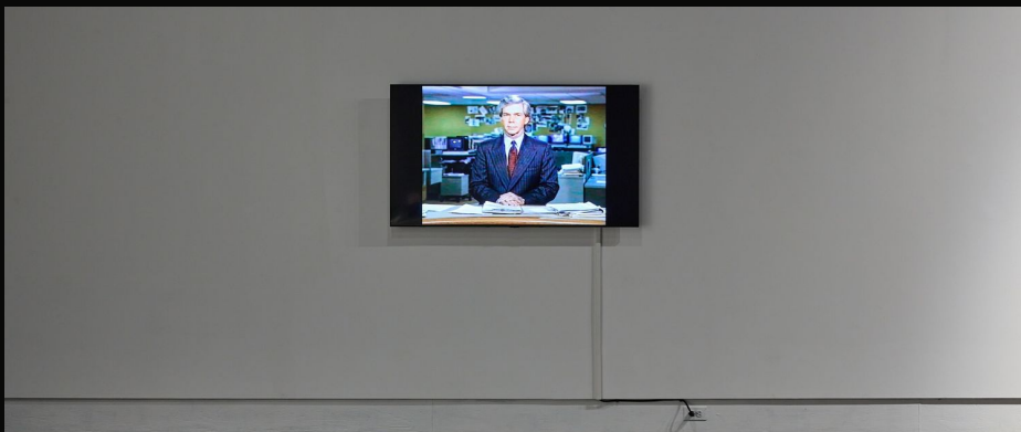
INSIDE REPORT: THE VICTORY BOX | INSTALLATION VIEW | PHOTO: SCOTT LEE PROJECT DOSSIER | JAMESMALZAHN.COM