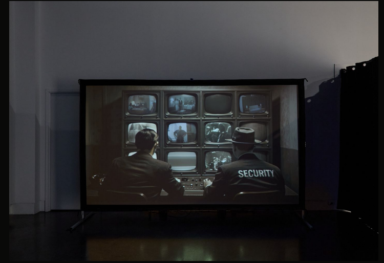
THE MONITORING ROOM | AI VIDEO + LIVE BROWSER COMPOSITING

A camera embedded in the Victory Box records short clips while the visitor occupies the living-room set. The familiar domestic scene becomes a site of data collection.