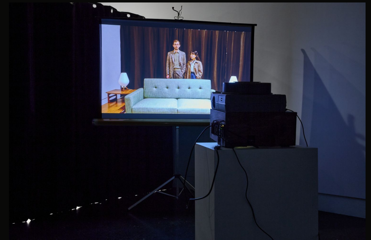
MODIFIED PROJECTION APPARATUS | LOCAL OFFLINE SYSTEM | PHOTO: SCOTT LEE